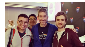
Atlassian Co-Founder, Scott Farquhar at Spark Festival 2018